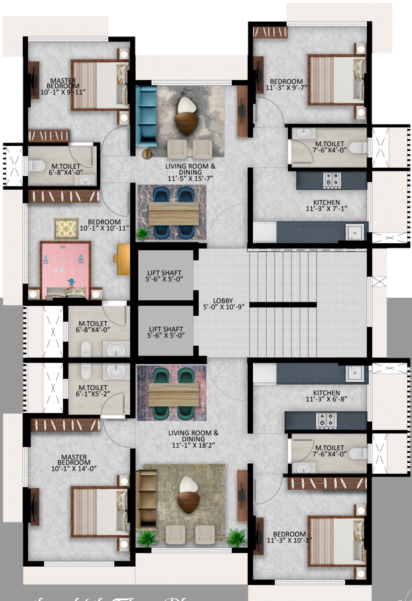
5th and 6th Floor Plan