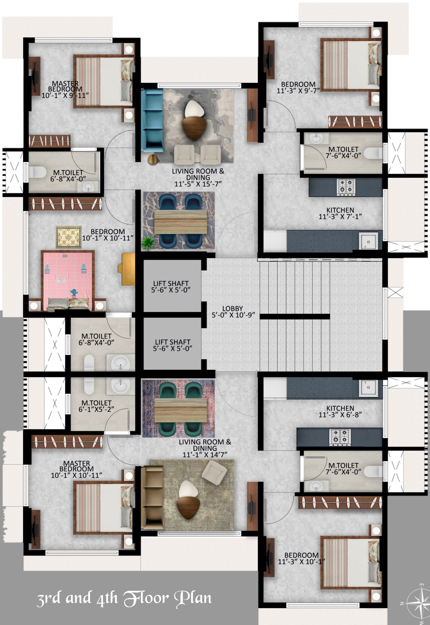
3rd and 4th Floor Plan