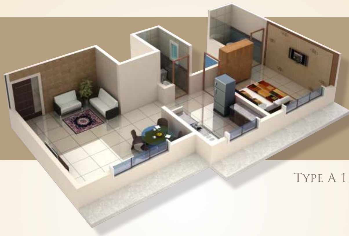
TYPE A 1BHK