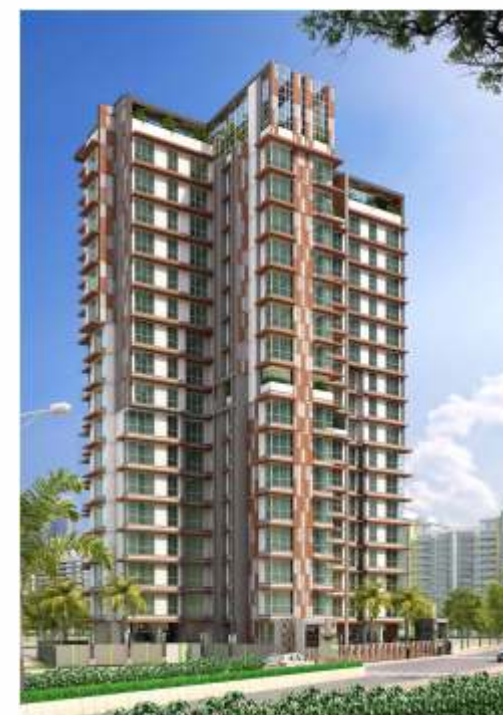
SWANAND OASIS, BLDG. NO. 33, KURLA (E)