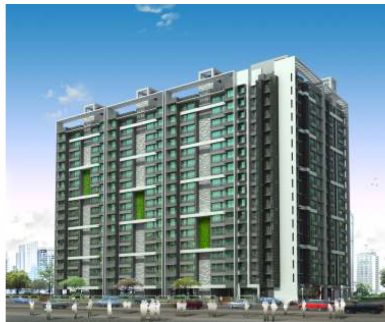
SKY VIEW CASTLE redefining life style... Kurla East