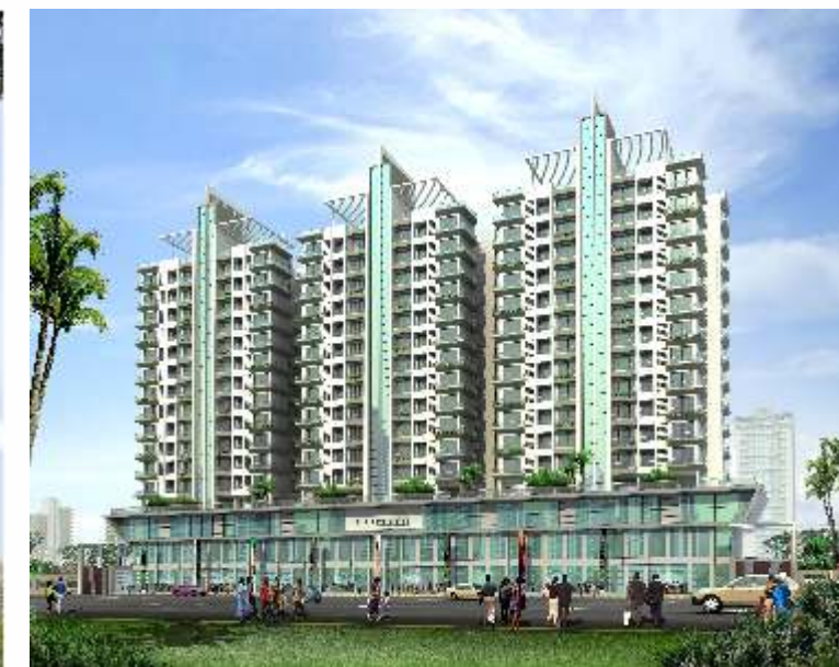
MANGAL MURTI, BLDG. NO. 120, KURLA (E)