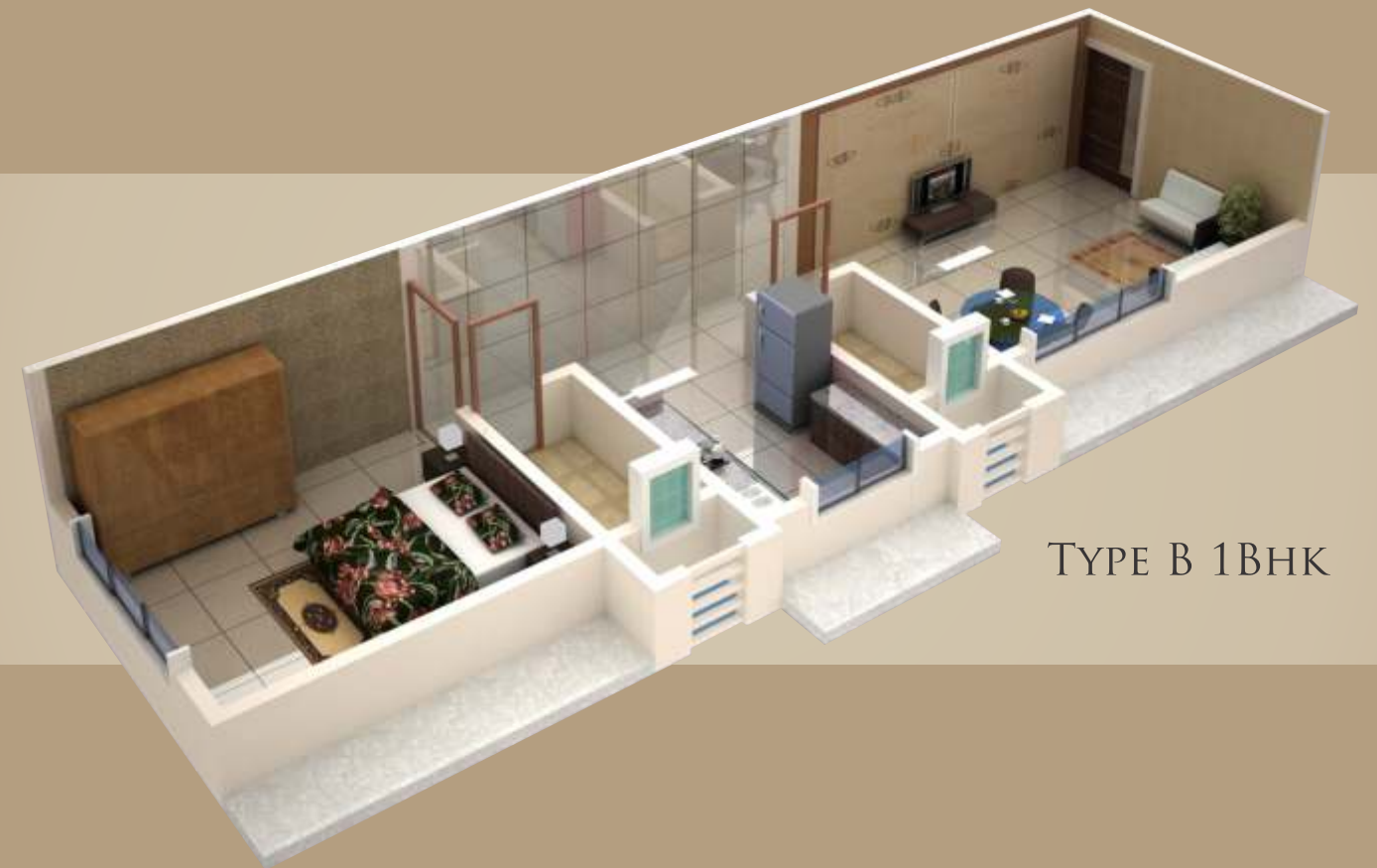
TYPE B 1BHK