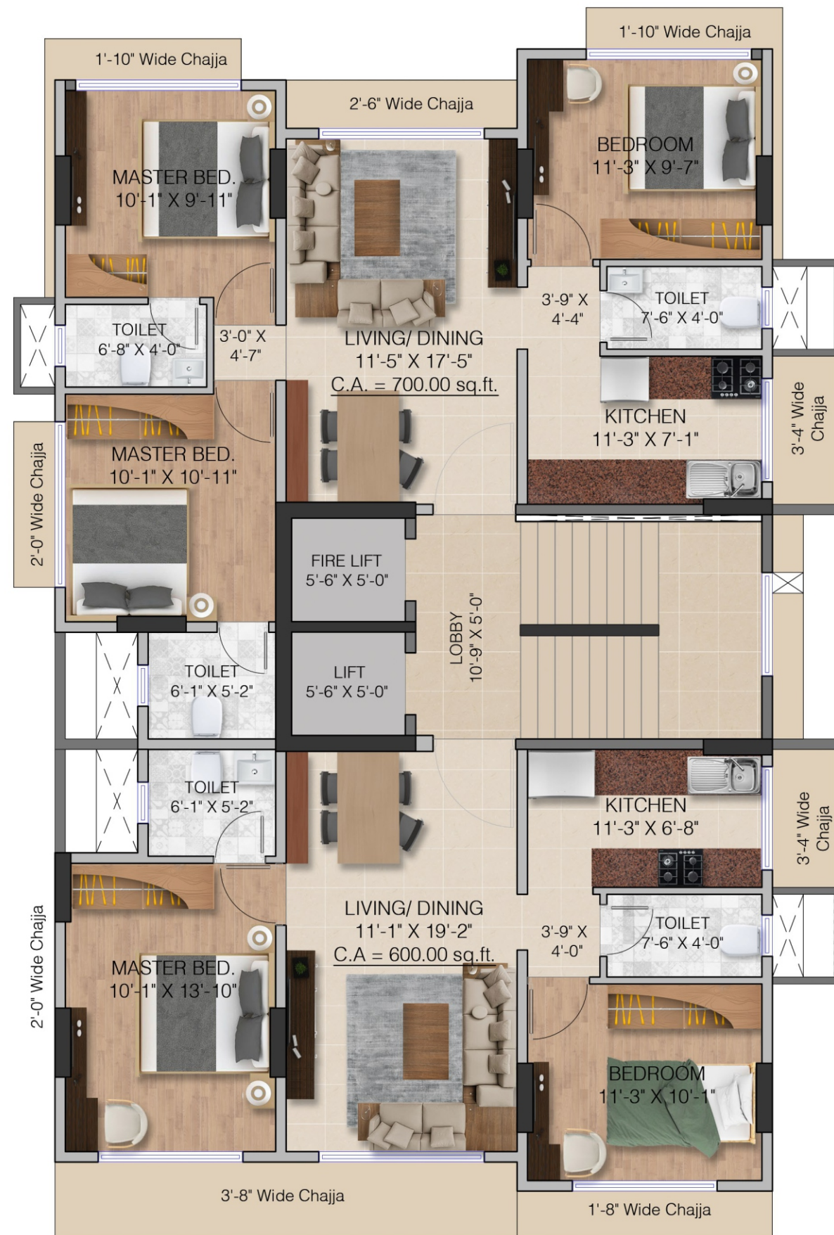
5TH TO 7TH FLOOR PLAN SCALE - 1:100