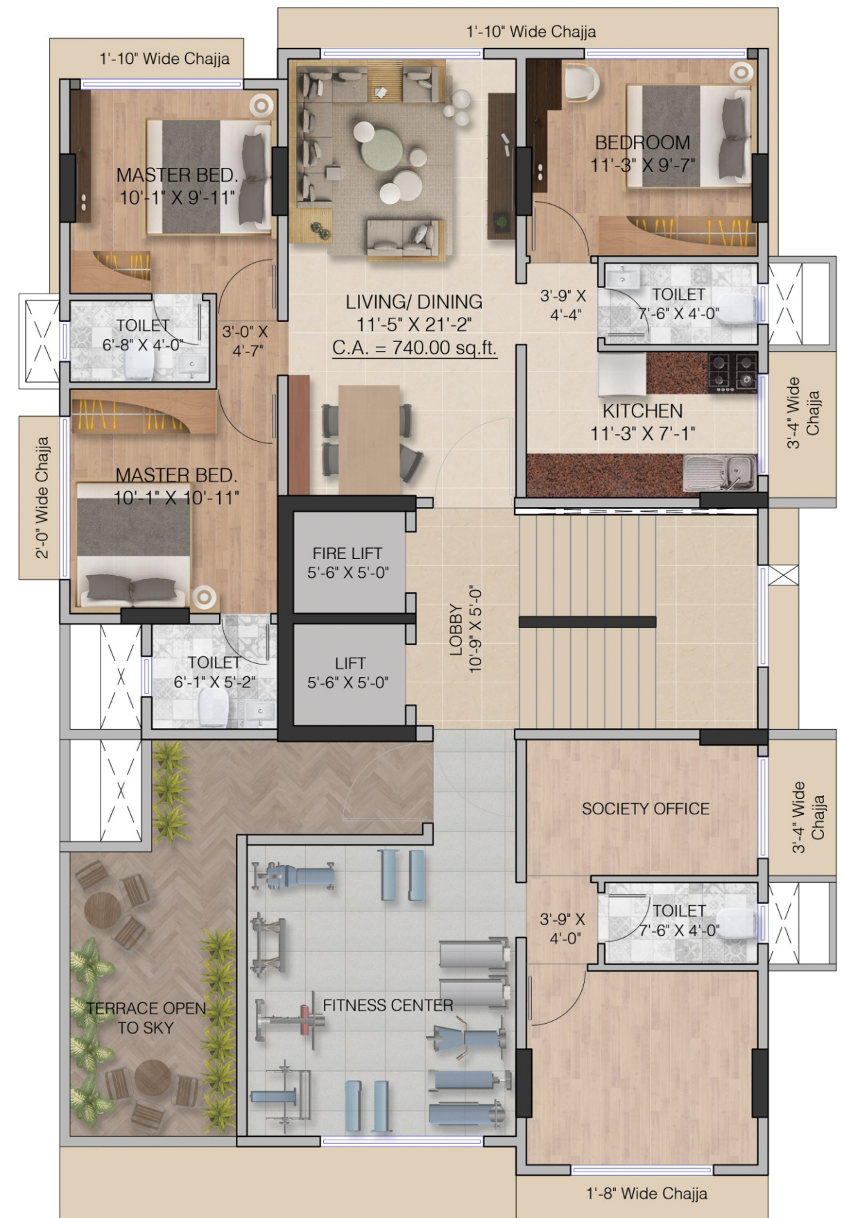
8TH FLOOR PLAN SCALE - 1:100